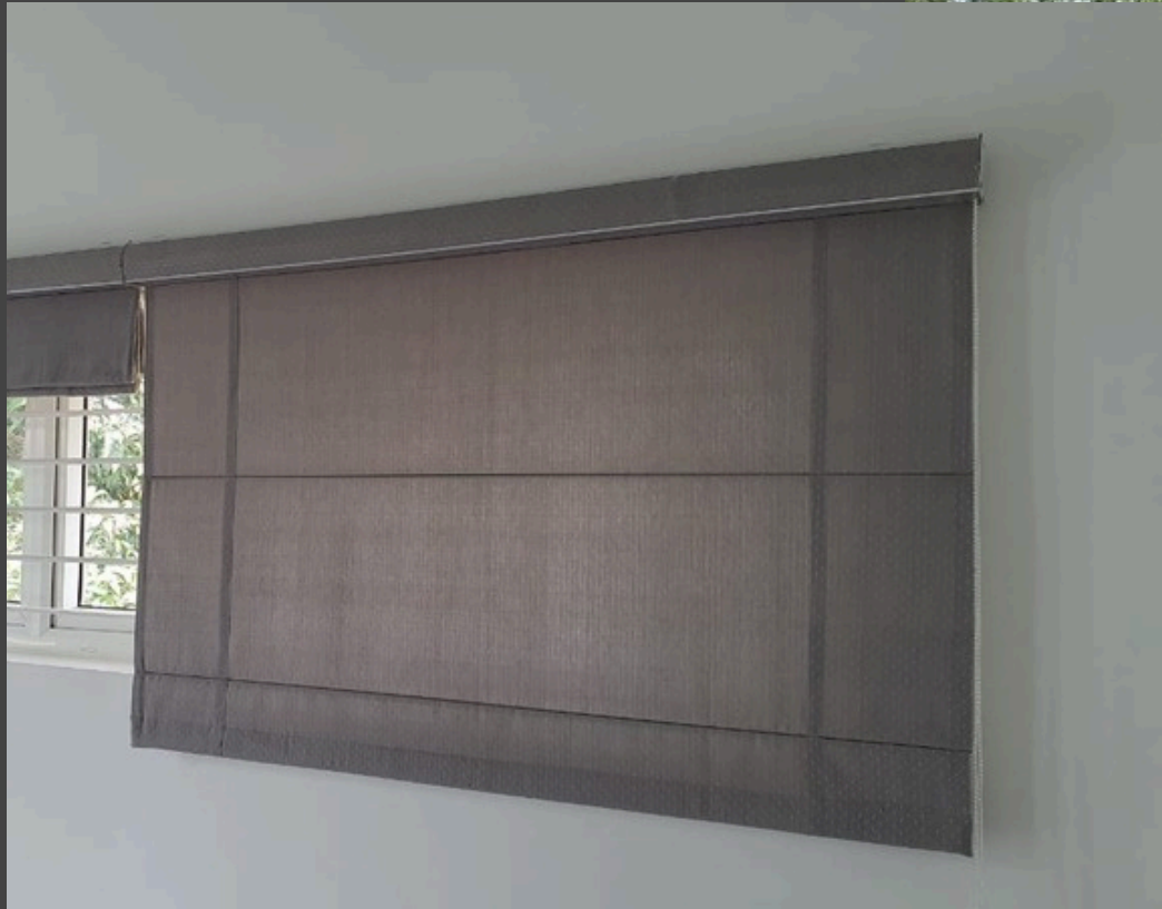
Roman blinds made in same fabric to match the curtains